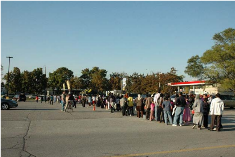
Gears and Morning Glory Cycling Club Bicycle Donation October 7 th , 2011 Thornccliffe Park